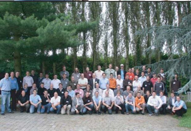
Zarafa Summercamp 2008